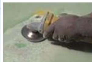
Epoxy Removal - Floors