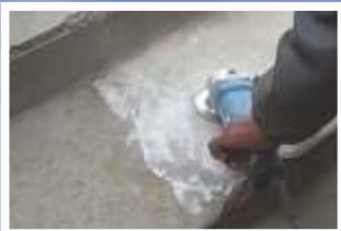
Slurry Removal - Floors