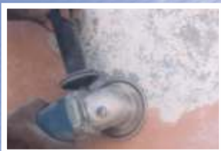
Rendering / Colour Peeling & Preparing Surface for Painting