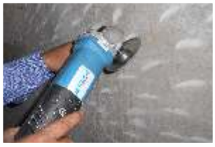
Hacking - Wall