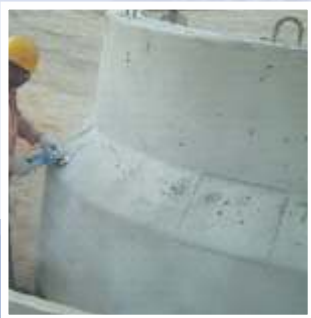
Remove Bulges & Offsets