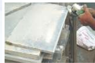
Chamfering, Nosing and Shaping on Granite/ Marble