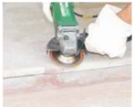
Marble / Tile finishing