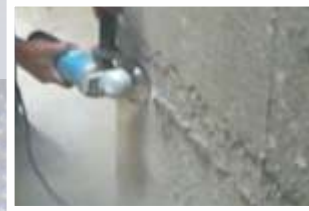
Merging / Leveling after De-shuttering