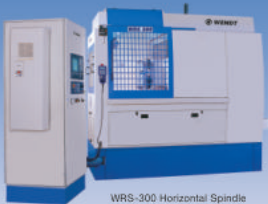
WRS-300 Horizontal Spindle