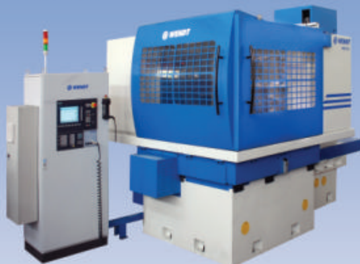
WRS-600 Horizontal Spindle