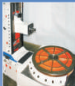
Rotary Table Ø1200 mm & 630 mm